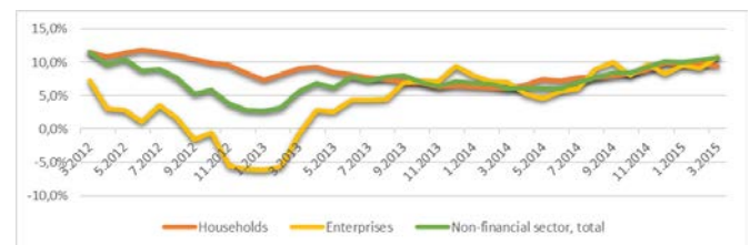
Fig. 2 Annual growth rate of deposits (non-financial sector)